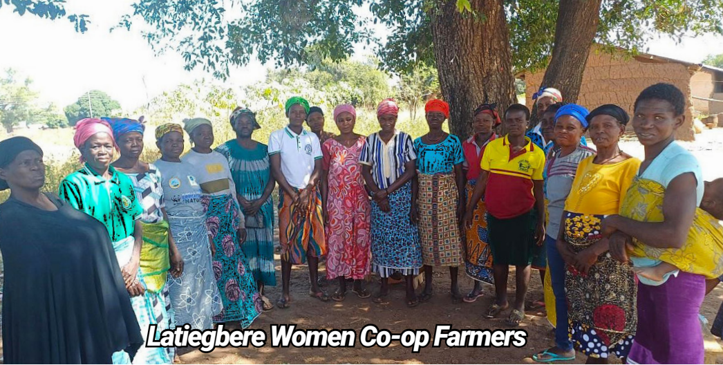
Latiegbere Women Co-op Farmers