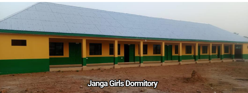
Janga Girls Dormitory

NEA first connected with the Janga community in 1981. After ensuring the sustainability of earlier development initiatives, the project site buildings were repurposed for a new secondary school. Thanks to St. Paul's Church - Leaskdale, the girls' dormitory is now complete. The dormitory provides a safe living environment, reducing long daily walks to school. Girls can now study in the evenings instead of spending time on domestic tasks.