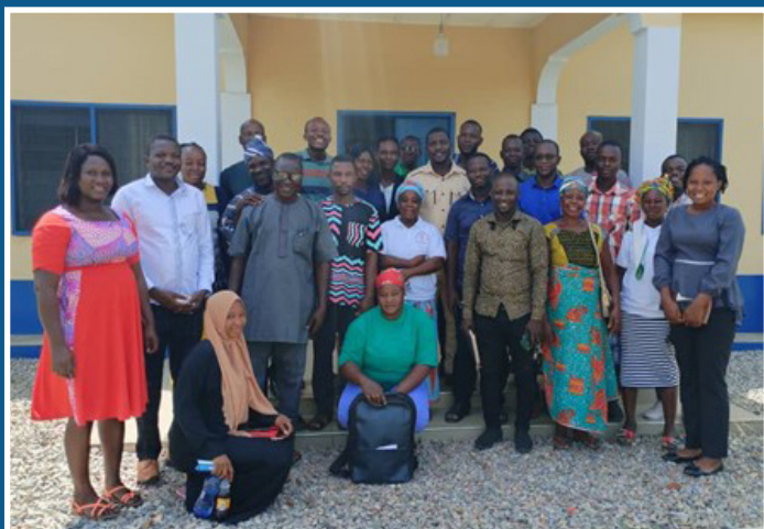
The Babanayaa Project staff and stakeholders met to strategize for the project's long-term sustainability.

Discussions centred on lessons learned from the project, its impact on communities and individuals, and considerations for retaining successful elements while integrating new components for Phase 2. These insights are being carefully reviewed, hoping to submit a compelling proposal that extends benefits to more communities in the years ahead.