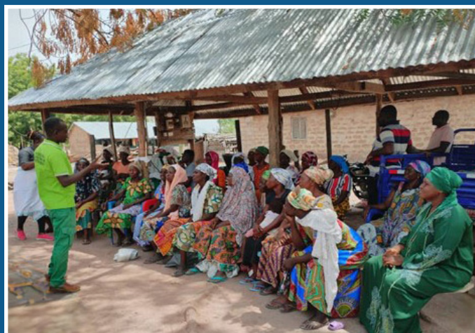
New co-op members receive training from an extension officer.

Each of these projects and programs is a step forward in our journey together of transforming people and transforming communities.