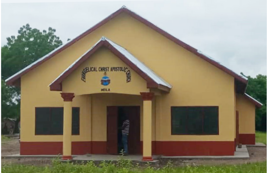
Weila Church Building