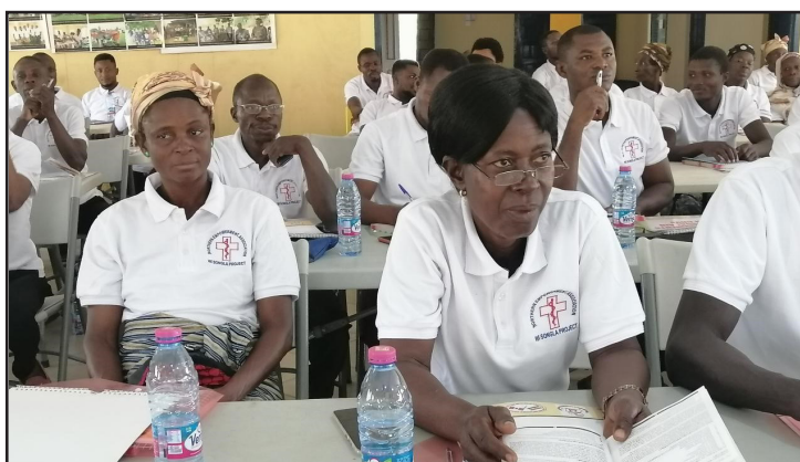
Wi Songla Project Volunteers Training