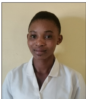
LYDIA KUBAAR Secondary School (General Science)

Through the Babanayaa Project , two girls were also given opportunities to pursue late secondary education and nine young women were awarded post-secondary education scholarships.