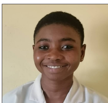
JINCHE DARI Secondary School (Home Economics)