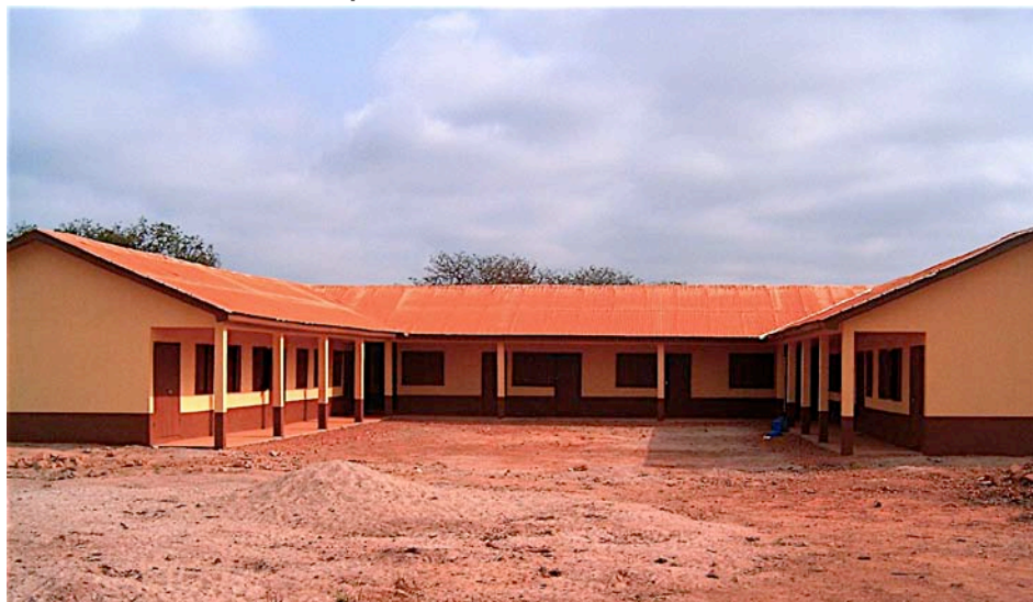
Junior High School, Carpenter