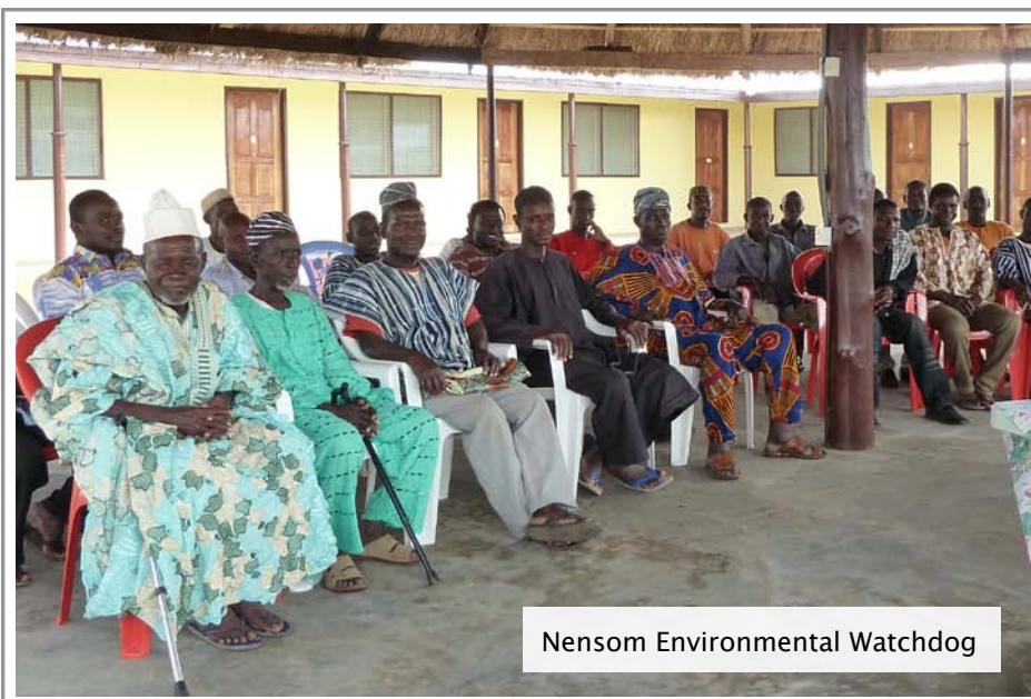
Nensom Environmental Watchdog

The Government of Canada, through the Canadian International Development Agency, provides funding for this environmental protection initiative as part of the Deg Community Health project. Your general donations to GRID are directed towards this project and are matched on a 3:1 basis by CIDA.