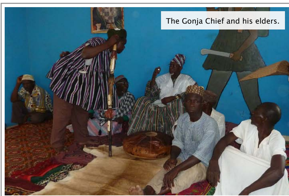
The Gonja Chief and his elders.

CIDA provides funding for chiefs' peacebuilding training as part of the Deg Community Health project.