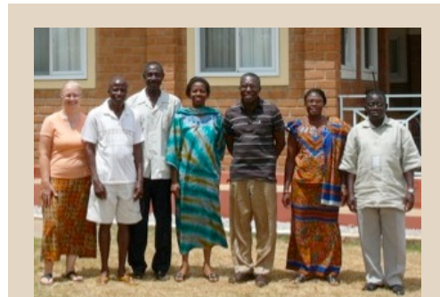
NEA Board Members participated in the evaluation of GRID/NEA projects in Ghana. All were greatly encouraged by the evaluation findings.